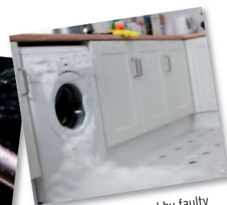
Follow-up costs caused by faulty appliances