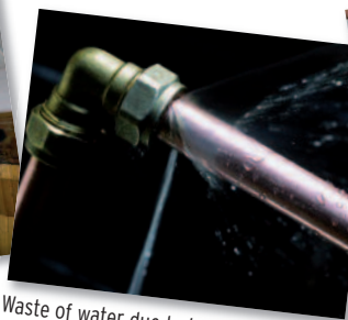
Waste of water due to leaking pipes