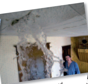
Tremendous damage caused by a pipe burst