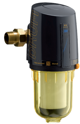
DRUFI+ FF Cartridge filter