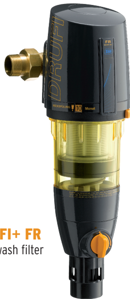
DRUFI+ FR Backwash filter