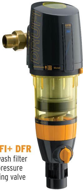
DRUFI+ DFR Backwash filter with pressure reducing valve

Award-winning design and clever features. This is the DRUFI system: reliable and safe water pressure. Clean water without dirt particles. Reduced water consumption with individual water-saving pressure setting. Easy to install and ideal maintenance comfort.