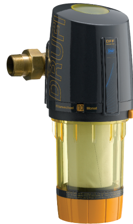
DRUFI+ DFF Cartridge filter with pressure reducing valve